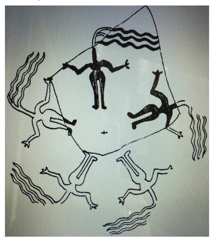
Fig. 1. Painted pottery from Samarra, Iraq (after Herzfeld 1941, 30 Fig. 36)