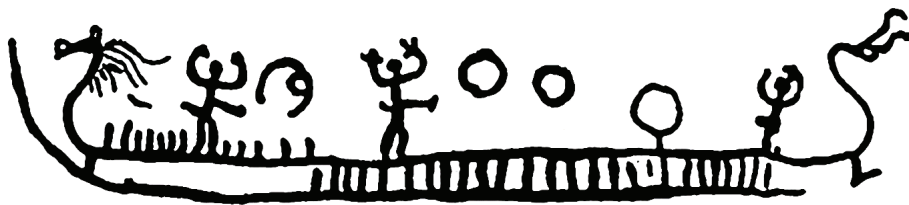
Fig. 2. Carving from Skjeberg, Norway (after Gelling, Davidson 1969, 54, Fig. 23)