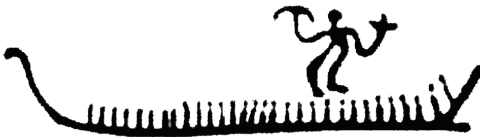
Fig. 3. A carving from Bohuslän, Sweden (after Bradley 2006, 383, Fig. 8)